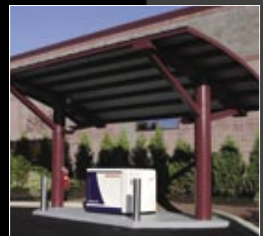
Hydrogen Home Energy Station at Honda.

For more information about the FCX and the Civic GX, visit http://world.honda.com/FuelCell and www.civicgx.com or call 1-800-33-HONDA.