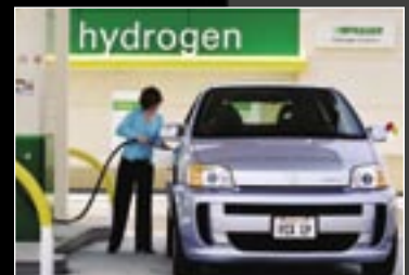
Hydrogen stations are few, but growing.