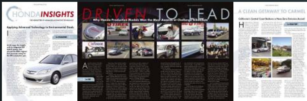
Honda special advertising section in Spring 2004 magazine